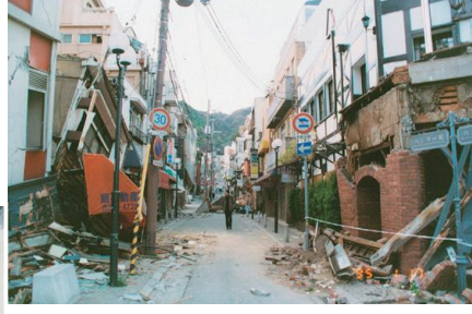
1995 阪神·淡路大震災 (Great Hanshin-Awaji Earthquake) ◀ Left: A school ▲ Top: Post-quake cityscape