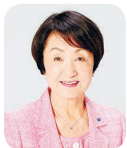
Hayashi Fumiko Mayor of Yokohama

In the midst of the corona crisis, the City of Yokohama led the world in holding a major international arts festival, Yokohama Triennale 2020, and our annual Autumn Satoyama Garden Festa with many autumnal flowers of Yokohama posted the largest attendance in its history. Even now, we are holding yorunoyo -- Yokohama Cross Light Illumination, decorating