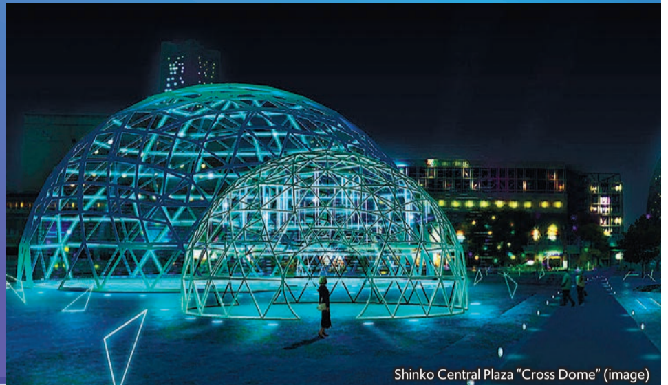
Shinko Central Plaza "Cross Dome" (image)