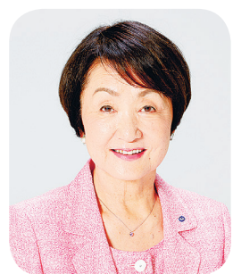
Hayashi Fumiko Mayor of Yokohama

As part of Yokohama's New Coronavirus Living and Economic Countermeasures, the city has passed the largest supplementary budget in its history at ¥574.3 billion, and has put in place a range of emergency measures. Beginning with a special fixed cash distribution of ¥100,000 per person, the countermeasures further include support for providing medical care for patients tailored to the severity of their symptoms and support for those working on the frontlines of healthcare, and strengthening our system for PCR testing. They also include a new financing menu to support the management of our small- and medium-size enterprises (SMEs), support for our shopping districts, and for our small business owners. We are doing all we can to support our citizenry, our business people, and our medical practitioners.