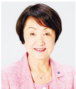
Hayashi Fumiko Mayor of Yokohama

In order to prevent the spread of infection by the new corona virus, the City of Yokohama is taking measures prioritizing the health and safety of all our citizens. Giving first priority to the health and safety of our elementary, junior and high school students, we have temporarily closed all of Yokohama’s 510 municipal elementary, middle, and high schools. Regarding city facilities used by the public, we have also closed all of our facilities with the exception of selected welfare and other institutions. We have further either cancelled or postponed to a later date all planned public events and other activities sponsored by the city. We would like to offer our heartfelt thanks to all of the organizers and to all of the citizens of Yokohama for their great understanding and cooperation.