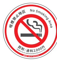
Non-smoking zone road surface sign