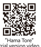
“Hama Tore” trial version video

[Inquiries] Health and Social Welfare Bureau Regional Comprehensive Care Promotion Division Tel: 045-671-3464 Fax: 045-550-4096