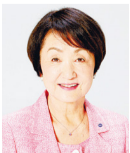
Fumiko Hayashi Mayor of Yokohama

Yokohama Otomatsuri 2019, the third round of Japan's largest music festival, is back again after three years. For two full months until the festival's close on November 15 the streets of Yokohama becomes the stage for more than 300 musical acts, from professional artists to gifted amateurs alike. Now music literally overflows throughout the city.