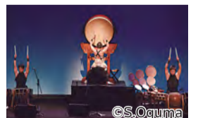
▲ Eitetsu Hayashi Special Performance (Image)

Contact for inquiries: Executive Committee Tel: 045-663-1365 Fax: 045-663-1928