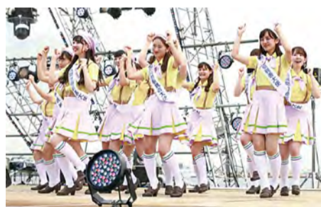
▲ Special performance by the "Hamakko" Yokohama girl dance unit.

Venues: Rinko Park, Minato Mirai 21 District, Shinko District and surroundings