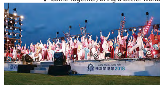
▼ Come together, bring a better world!