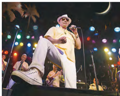
▲ CRAZY KEN BAND