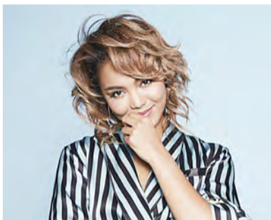
▲ Crystal Kay