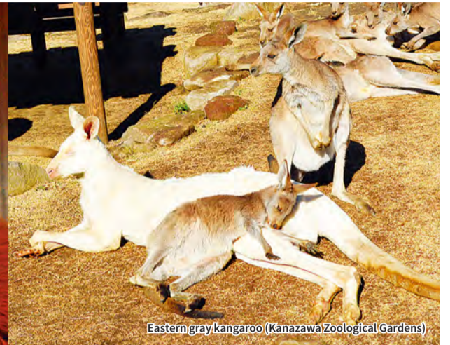
Eastern gray kangaroo (Kanazawa Zoological Gardens)