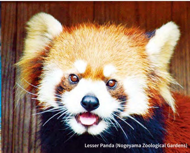
Lesser Panda (Nogeyama Zoological Gardens)