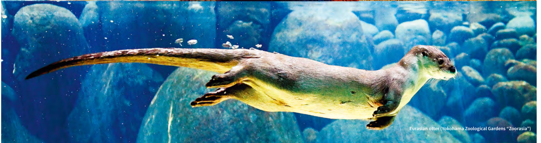
Eurasian otter (Yokohama Zoological Gardens "Zoorasia")