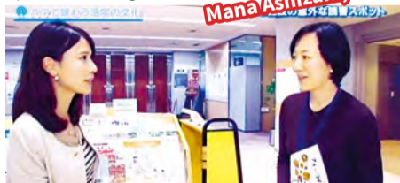
Describing the information library at the Gender Equality Center Yokohama