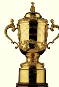
TM © Rugby World Cup Limited 1986. All rights reserved.

In addition, there will also be priority ballot applications for members of the JRFU Members Club, Sunwolves Official Fan Club, and certain other organizations beginning on January 19 (Fri.) in the case of set tickets and February 19 (Mon.) in that of general tickets.