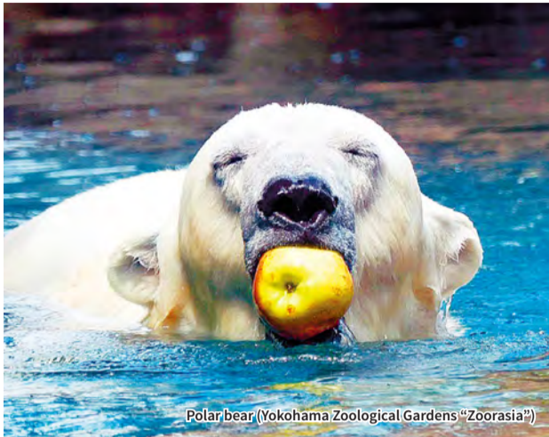
Polar bear (Yokohama Zoological Gardens "Zoorasia")