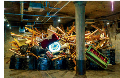
《Project God-zilla—Landscape with an Eye—》2016

As might be gathered from its title “Project God-zilla—Landscape with an Eye—,” the work by Yukinori Yanagi features a huge eye staring out in a pile of discarded wood, electrical products, and other rubbish.