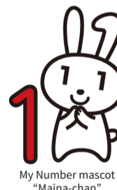
My Number mascot "Maina-chan"

* Notification card: a paper card informing you of your My Number (personal number).