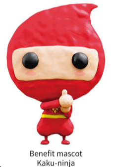
Benefit mascot Kaku-ninja