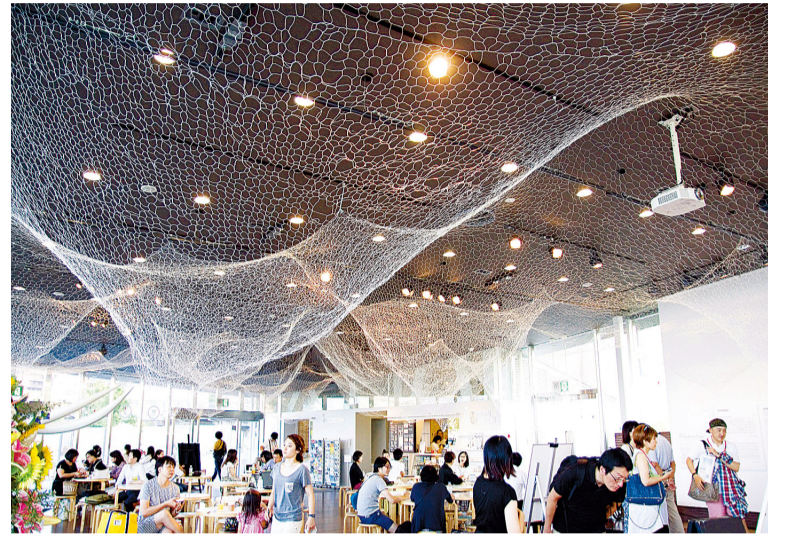
The scene at the previous whitescaper

Contact: Secretariat Tel: 045-661-0602 Fax: 045-661-0603