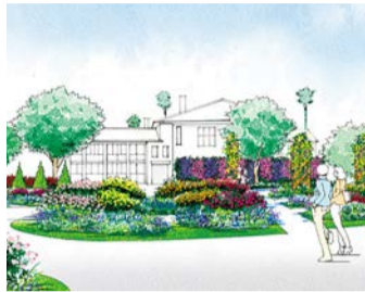
Conceptual drawing of the appearance of Harbor View Park

Venue "Green-rich Yokohama," Satoyama Garden Sites: Future site of botanical gardens (adjacent to Yokohama Zoological Gardens "Zoorasia")