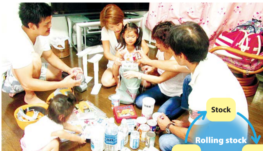
Stock items that match your family makeup, and consume them on a daily basis