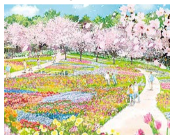
Conceptual drawing of the flower garden

At sites such as Yokohama's biggest flower garden measuring 10,000 square meters and the Iris Garden featuring beautiful scenery, visitors will be able to sense and experience firsthand the charms and pleasures of local natural settings accenting the character of Yokohama, where many green tracts remain.