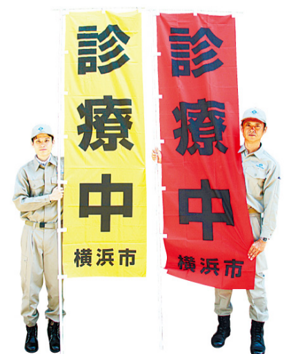
Look for the colored banners!