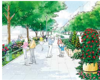
Conceptual drawing of the appearance of Nihon Odori

Nihon Odori will be decorated with tulips, roses, and other flowers. Meanwhile, the Rose Garden in Harbor View Park will be planted with 1,200 English Roses as well as silver and blue annual and perennial plants.