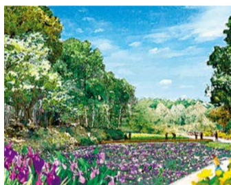
Conceptual drawing of the Iris Garden