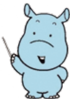
Dai-chan, mascot for Environmental Planning Bureau