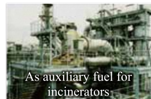
As auxiliary fuel for incinerators