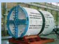
Shield tunneling machine

The city's sewerage system consists of separate and combined systems both for efficient and speedy development. In urban areas, pipe jacking and shield tunneling methods, which have a small impact on traffic, were adopted to install sewer pipes.