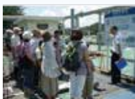
Site Visit for WTP

To raise public awareness and understanding, many activities were implemented such as site visits of sewerage facilities, education of students, and conduct of public forums.