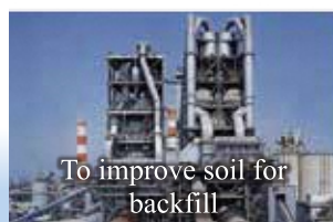
To improve soil for backfill

Incinerated sludge ash is used for improved soil and cement raw material in construction works.