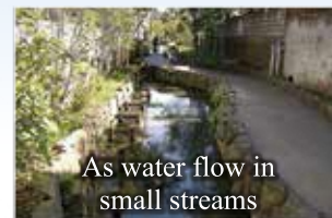
As water flow in small streams