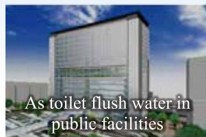
As toilet flush water in public facilities

Treated wastewater is used for cleaning/cooling of machinery, toilet flush water and landscaping in public utilities.