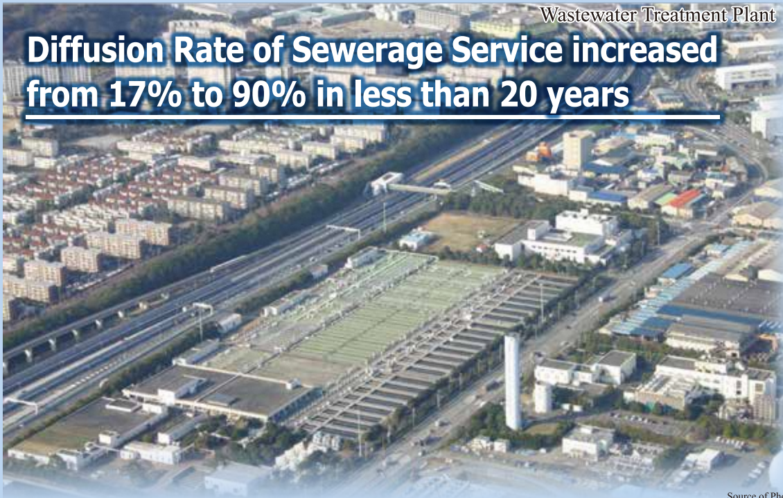
Wastewater Treatment Plant

Diffusion Rate of Sewerage Service increased from 17% to 90% in less than 20 years