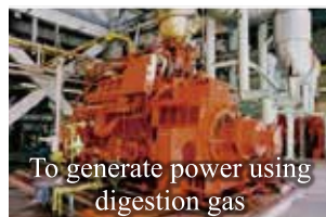
To generate power using digestion gas

Digestion gas is used for gas engine to generate power and for fuel of incinerators in the sludge treatment plant.