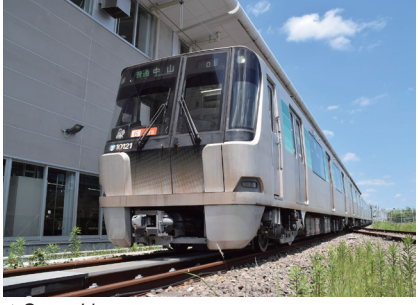
▲ Green Line