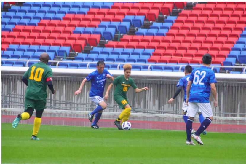
[Friendly soccer match at Nissan Stadium as part of Friendship Event]