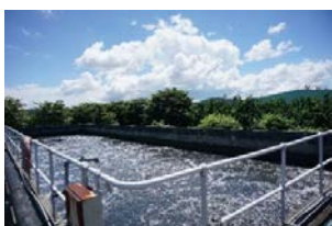
Waste water treatment facility in Batamindo Industrial Park

The officials from the International Affairs Bureau also traveled to Bangkok, Thailand, on July 13-14. There, they met with local businesses and related organizations to discuss integrating "smart" technology into Bangkok's industrial parks and recycling waste materials from paving roads.