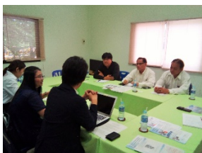
Meeting with Bangkok Metropolitan Administration

On July 11, officials from the International Affairs Bureau of Yokohama had meetings with the officials from Batam City, Indonesia and the Batam Indonesia Free Zone Authority (BIFZA), which administrates infrastructure in Batam such as ports, waterworks, and industrial parks, to discuss further technical cooperation through the Y-PORT project to promote sustainable development over the coming years.