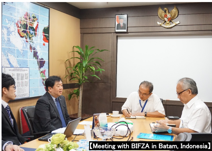
[Meeting with BIFZA in Batam, Indonesia]