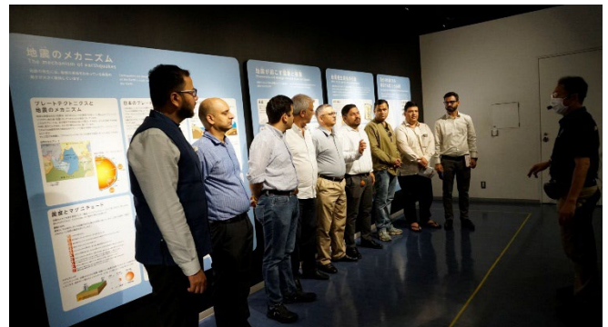
Site visit to the Yokohama Disaster Risk Reduction Learning Center

International Organizations Center 6F, Pacifico Yokohama, 1-1-1 Minato Mirai Nishi-Ku, Yokohama, JAPAN 220-0012 TEL: +81-45-221-1214 E-mail: citynetyokohama@gmail.com