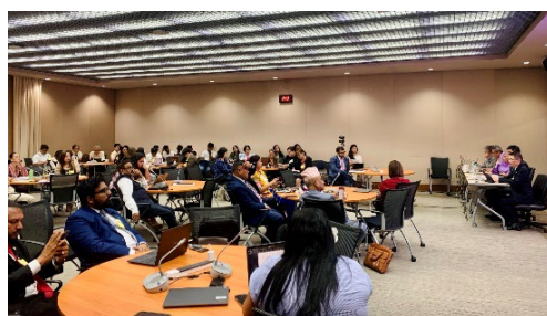
Photo during Local and Regional Government Assembly