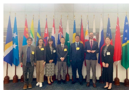
Group photo of VLR team from the City of Santa Rosa and the City of Yokohama