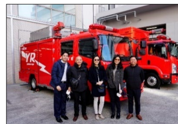
Site Visit by the City of Makati – Fire Department Headquarters Government Building and City Hall