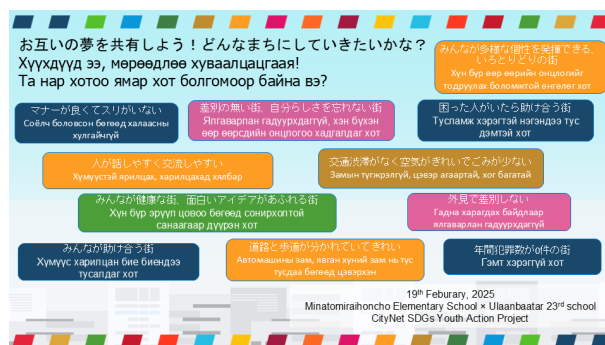
Visions for the Future Cities