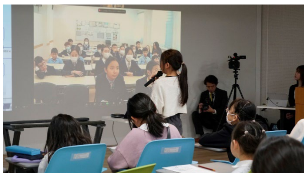
The Exchange Meeting between Mongolia and Japan

In the previous exchange meeting held in December 2024, students introduced their daily initiatives against littering. Two months later, students from both schools shared the result of their initiatives. Students from Yokohama city showcased a special trash box that can be settled outside. Students from Ulaanbaatar introduced awareness posters promoting waste separation. During the meeting, not only the presentations but also some quizzes about both countries' cultures are introduced. After the presentations, students discussed their visions for the future cities they want to live in. These opinions were illustrated in a drawing, incorporating both Japanese and Mongolian languages. Through this exchange event, students developed a deeper curiosity about each other's culture and initiatives on SDGs. We look forward to seeing their efforts succeed in the future!!