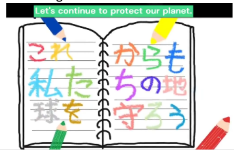
Art Works of students in Yokohama City

Students from both schools are planning to continue SDGs exchange activities, just as they did last year. What makes this year particularly remarkable is the introduction of Virtual Reality technology to promote more efficient and advanced communication. We are looking forward to seeing how they will discuss and what output will appear.