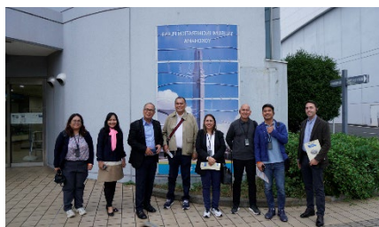
Tour-C exploring Tsurumi-Ward Waste Incineration Plant