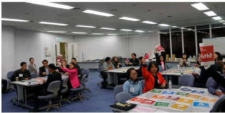
Icebreaking SDGs Quiz Competition