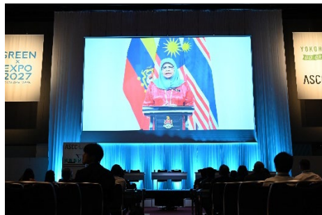
Video message by Maimunah Sharif, Mayor of Kuala Lumpur