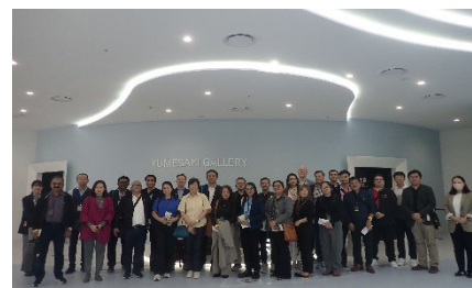
Tour-D exploring Minato Mirai 21 District

International Organizations Center 6F, Pacifico Yokohama 1-1-1 Minato Mirai Nishi-Ku, Yokohama, JAPAN 220-0012 TEL: +81-45-221-1214 E-mail: CITYNETyokohama@gmail.com