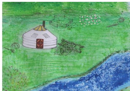
Art Works of students in Ulaanbaatar City