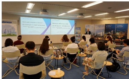
Presentation about the Aging Society