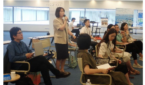
Active Q&A and discussion session by the participants