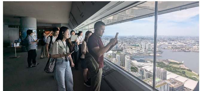
The visit of the Yokohama Landmark Tower