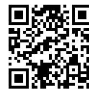
13th ASCC Website

*The CityNet SDGs Cluster Seminar will be held during one of the thematic sessions at ASCC on Oct. 24th (Thur).