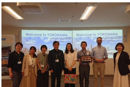
Group Photo with Delegates from Taoyuan City