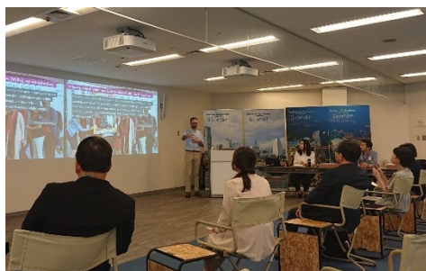
Presentation of VLR from IGES