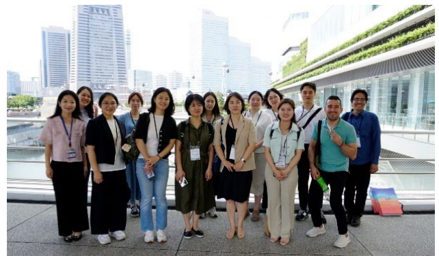
Group Photo of the Korean delegation in the Minato Mirai 21 district in the City of Yokohama

As a collaborative program between the CITYNET Secretariat, CYO and the City of Yokohama, a delegation from Korea visited Yokohama City from July 24 th to 27 th , 2024. The delegation consisted of 12 members from various cities and organizations in Korea, as well as three CITYNET secretariat members. There were representatives from Seoul Metropolitan Government, Busan Metropolitan City, Suwon City, Jongno-gu, Dongdaemun-gu, Dobong-gu, the Seoul Institute, the Seoul Digital Foundation, and Seoul Tourism Organization . The objectives of this visit were 1) to promote learning exchange on SDGs between Yokohama and Korean CITYNET members, 2) to showcase the best practices of SDGs focusing on public administration, citizen and private sector engagement and sustainability, 3) to develop action plans that demonstrate commitment to promote SDGs, and 4) to learn about various SDGs practices in Yokohama through field visits.