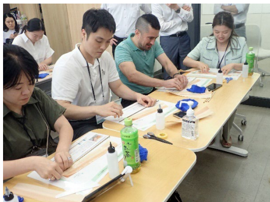
Workshop in Yokohama SDGs Design Center

They also visited Yokohama SDGs Design Center , which was jointly established and operated by the City of Yokohama and the private sector. Their role is to connect the SDGs-related needs and seeds of diverse entities inside and outside of the city in order to achieve SDGs. They explained about the “ Y-SDGs ” certification system under which the City of Yokohama certifies the enterprises and organizations working for SDGs and gives them many benefits such as bidding, and financial and advisory services. The delegation participated in the workshop to make wooden straws in the Center. The workshop was held to raise awareness of the citizens on SDGs. The delegation reaffirmed the importance of raising awareness of their citizens to achieve SDGs.