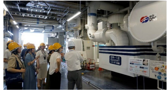
Study tour of the plant in MM21 DHC

The Korean delegation participated in three site visits for the program. They first visited Minato Mirai 21 District Heating and Cooling Co., Ltd. (MM21 DHC) , a company providing a high-efficiency district heating and cooling (DHC) system to Minato Mirai 21 District (MM21 district). MM21 DHC has been supporting the growth of the MM21 district thorough DHC system supplies since its foundation in 1986. As the district and the company developed, the service area of MM21 DHC has become the largest heat supply area in Japan in terms of heat volume sold per unit area. MM21 DHC has been working on decarbonization as well as investing and implementing the latest equipment every year and improving Coefficient Of Performance (COP) of its energy supplies. The delegation took a tour around the plant and learned about the system of DHC and their initiatives of decarbonization.