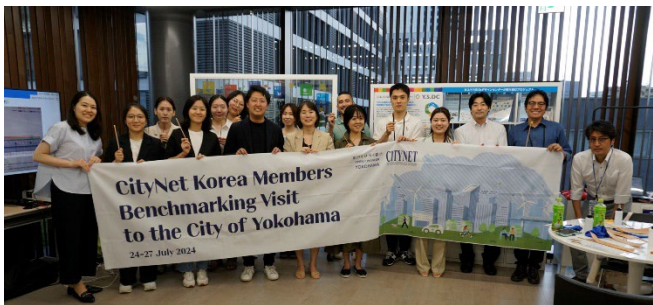
Group Photo in Yokohama SDGs Design Center with their handmade wooden straws after the workshop

They visited the Yokohama Landmark Tower located in the Minato Mirai 21 district, the central area of the city. They enjoyed the view of Yokohama from the 273-meter-high observatory and learned about the urban development of the city.