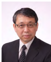
Kengo ISHIDA Chief Executive (in charge of International Environmental Strategies) Environment Bureau City of Kitakyushu