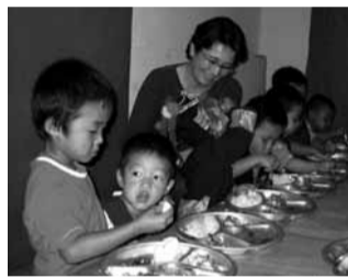
One of the AWC activities is the "Full Tummies Project (Onaka Ippai Project)," under which food provision support was launched from April 2008 for children who attend a child center in the mountain region of Northern Thailand that is home to indigenous tribes. The children have been able to eat until they are full, enjoying good, nutritious meals.

The Asian region is pursuing rapid economic development. However, this economic development is also leading to worsening labor conditions, destruction of the environment and increased disparities between the wealthiest and the poorest, all of which threaten the human rights of the most vulnerable in society, including women and children. AWC believes that it is important to empower the vulnerable in society to enable them to overcome difficult situations independently. As fellow Asians, women, parents and children, we are engaged in activities that seek to protect the rights of women and children in Asia, from the perspective of giving them assistance to engage in self-help efforts.