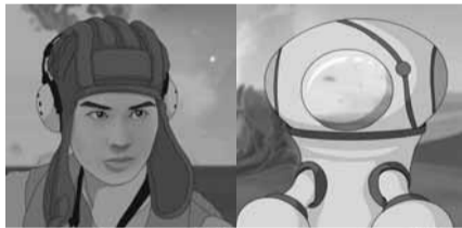
Apolo (left) & Mikaru (right)

"BATON" is a nouvelle science-fiction fantasy animation, produced and scripted by Shunji Iwai and directed by Ryuhei Kitamura. This theater piece is a collaboration between the world-renowned Ryuhei Kitamura, famous for his grand scale and dynamism which bring high drama and entertainment, and Shunji Iwai, with his sharp eye for cinematographic beauty. After real images have been taken, a special technology will be applied to transform these into anime, as the creators work to fashion an amazing piece of art that goes beyond the boundaries of standard animation. Production will be overseen by Tsuburuya Productions, a famous company in Japan, with Tit Mouse, inc from Los Angeles also participating. This is an SF fantasy that will emphasize the importance of linkage between the past, present and future.