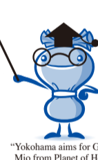
"Yokohama aims for G30" Mio from Planet of Hera

●Inquiries: Resource & Waste Recycling Services Bureau, Naka Waste Collection Office, Tel: 621-6952 (in Japanese)