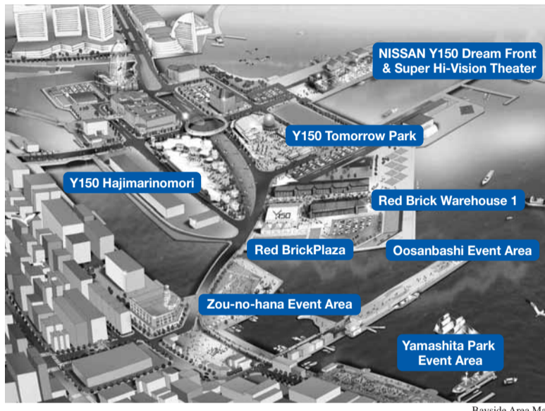
Bayside Area Map