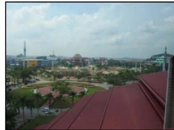
Batam City Hall