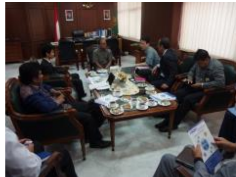
Kickoff meetings at Batam City Hall (left) and Batam Free Zone Authority (right) in April 2015.