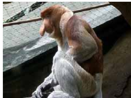
[Profile of a male adult Proboscis Monkey]

The City of Yokohama places their initiative of breeding and exhibition of the precious animals as part of the international contribution activities, and expects that these activities will provide an opportunity for people of Yokohama to start thinking about environmental conservation issues on a global scale.