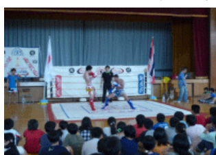
Thai National Sport Muay Thai Demonstration (at Hakkei Elementary School)

From June to July, people from the APEC member economies visited elementary schools in Yokohama city to interact with the students. The purpose of the program was to encourage the next generation to become interested in the history and culture of the APEC member economies, thereby providing them an opportunity to see the world with the global vision. People from 14 APEC member economies have visited 20 elementary schools and introduced their history, language, music, food, theatrical plays, and martial arts to the students.