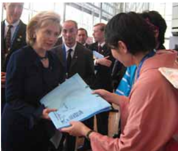
U.S. Secretary of State Hillary Clinton

Yokohama City have promoted “APEC Japan 2010 in YOKOHAMA” and “Convention city Yokohama” at its booth at the APEC 2009 in Singapore (November 9 – November 15, 2009). At the booth, the city of Yokohama was interviewed by media from home and abroad, and was visited by U.S. Secretary of State Hillary Clinton, Minister of Foreign Affairs Katsuya Okada and Minister of Economy, Trade and Industry Masayuki Naoshima. In addition, Yokohama studied local situations such as influence on civic life and the traffic regulation in Singapore.