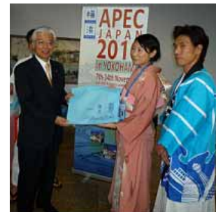
Minister of Economy, Trade and Industry Masayuki Naoshima