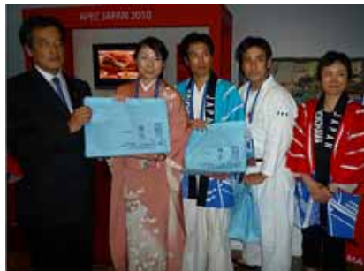
Minister of Foreign Affairs Katsuya Okada